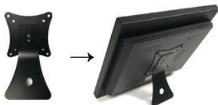
Simple desktop bracket