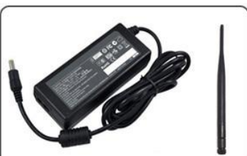
Power line&Wifi antenna