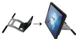
Desktop folding bracket

standard configuration: Wall bracke/Simple desktop /Embedded bracket (choose one in three) The other 2 stlyes for sell.